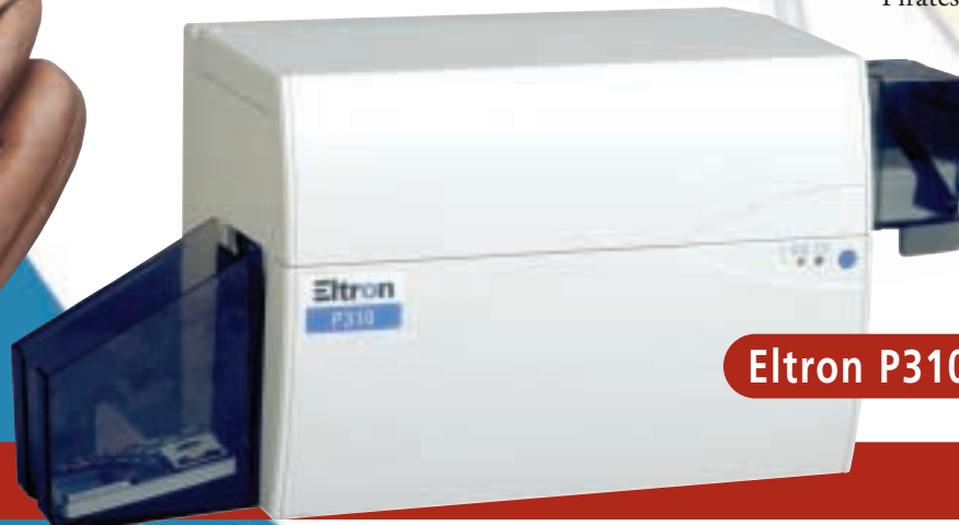
Eltron P310 Printer